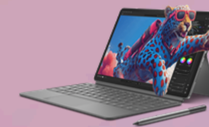
Lenovo Keyboard Pack for Yoga Tab ZG38C07688