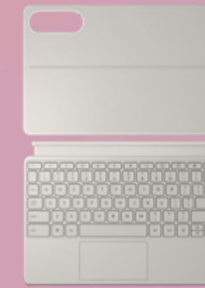
Lenovo Keyboard Pack for Yoga Tab ZG38C07710