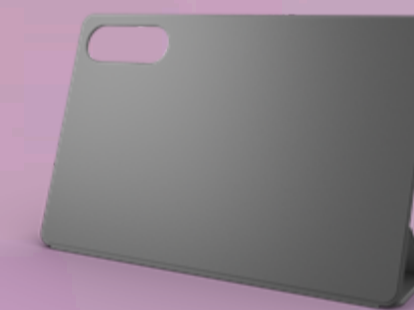
Lenovo Folio Case for Yoga Tab ZG38C07678

Please click here to view the full list of accessories.